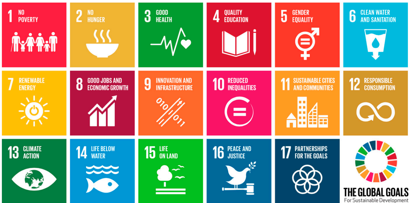
FIGURE 1 UN Sustainable Development Goals